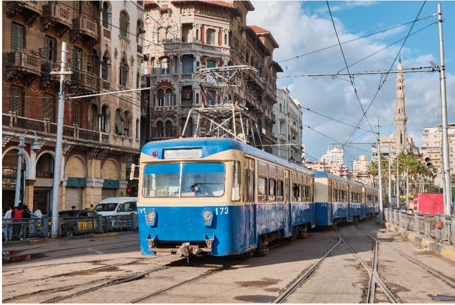
Alexandria's famous "blue tram" (Egypt)